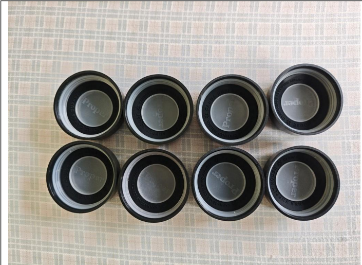
Color shade check