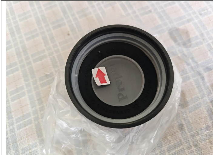
Dust mark inside -Min