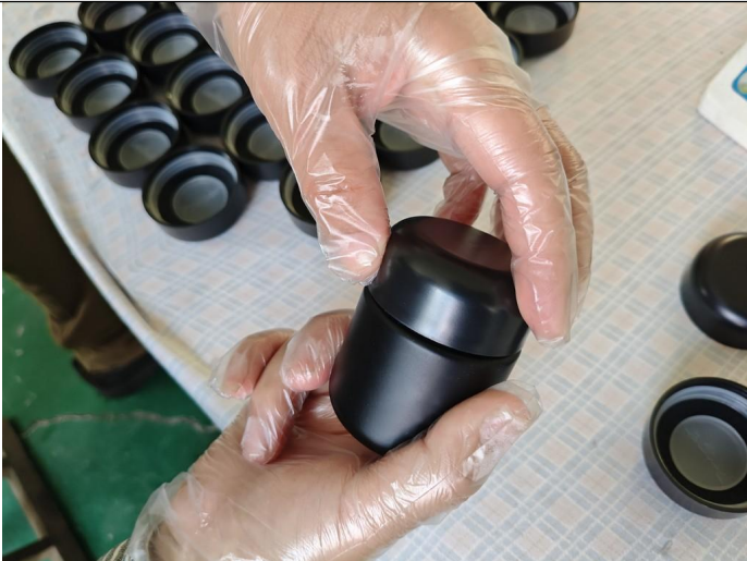
CR function test