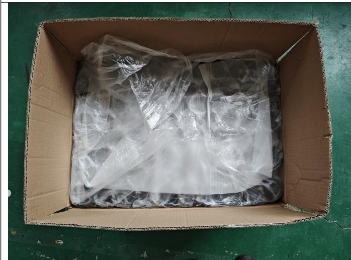
Open carton view