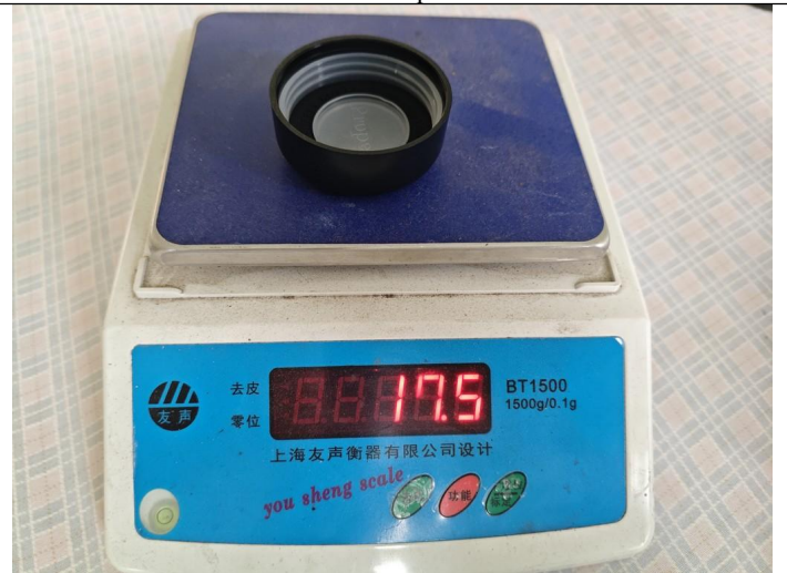
Product weight check