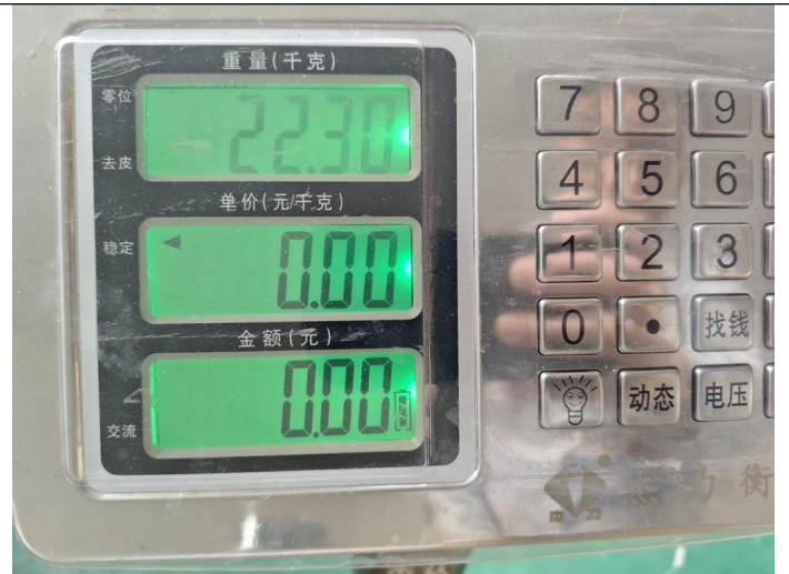
Carton weight check: 22.30 kg