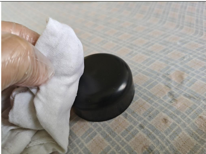
Color Fastness Test