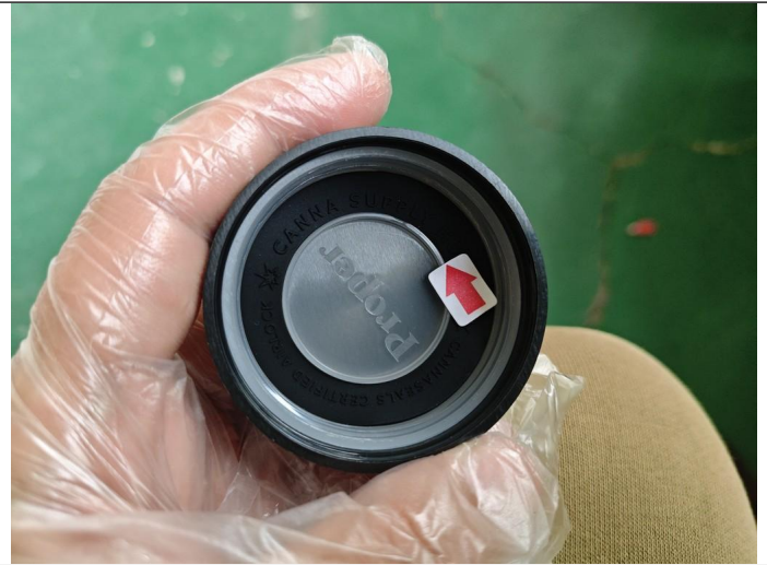
Deformed inside -MAJ