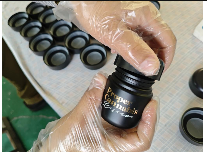
CR function test