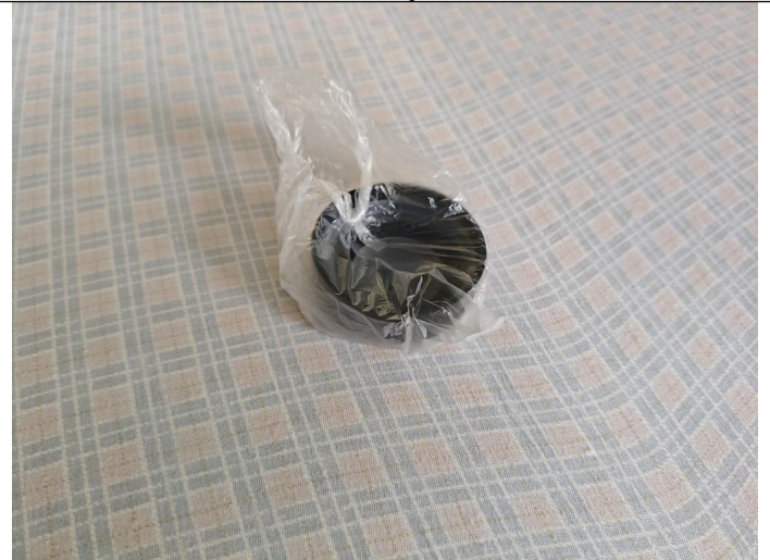
1 piece per polybag