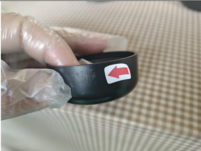
Scratch mark on out side -MIn