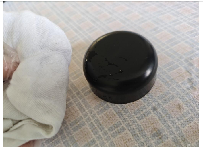
Color Fastness Test