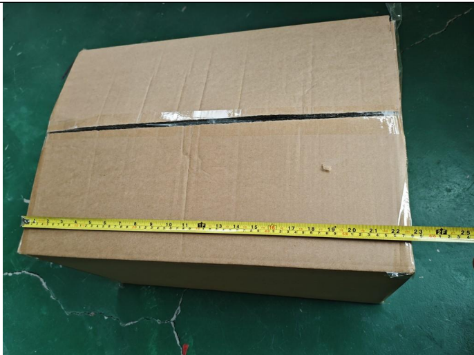
Carton size check:458x41x33 cm