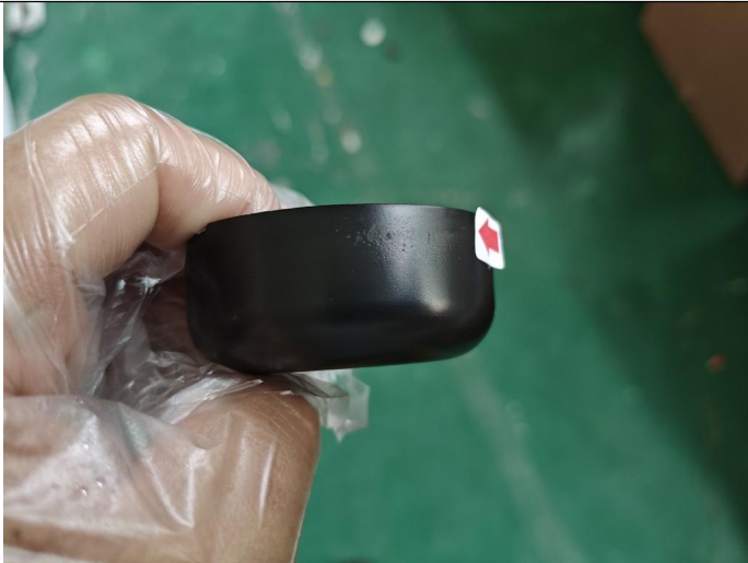
Scratch mark on out side -MIn