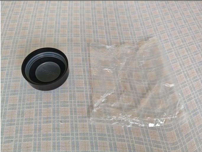
1 piece per polybag