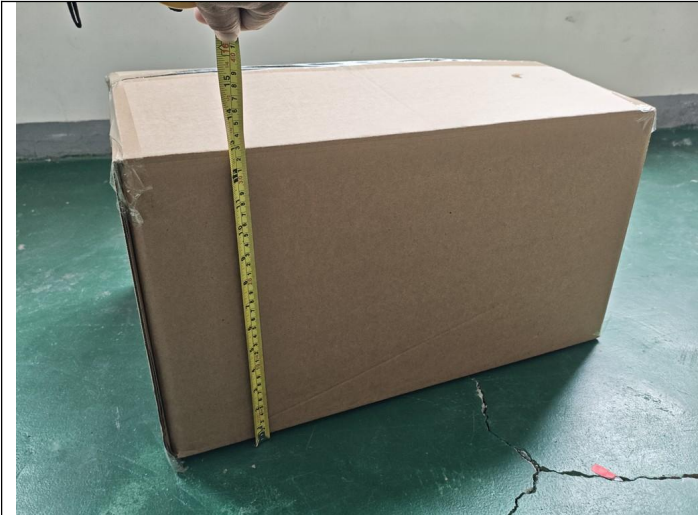
Carton size check:458x41x33 cm