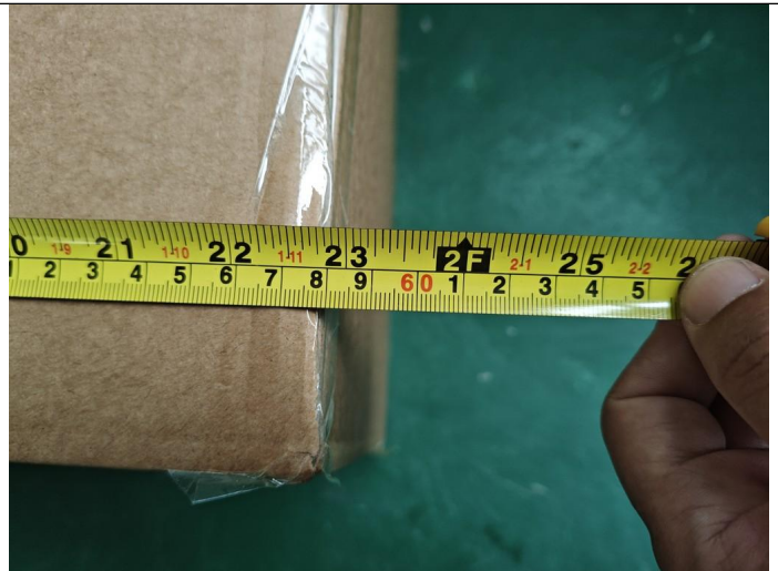
Carton size check:458x41x33 cm