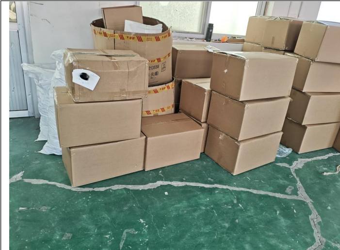
Carton storage after carton selection