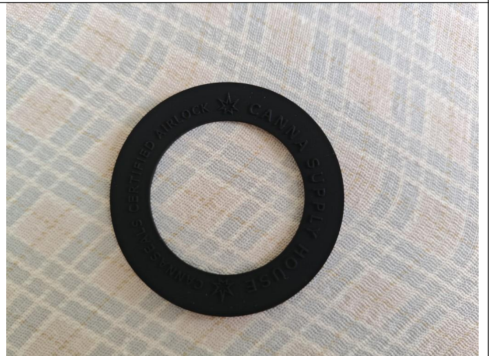
Product view / detail