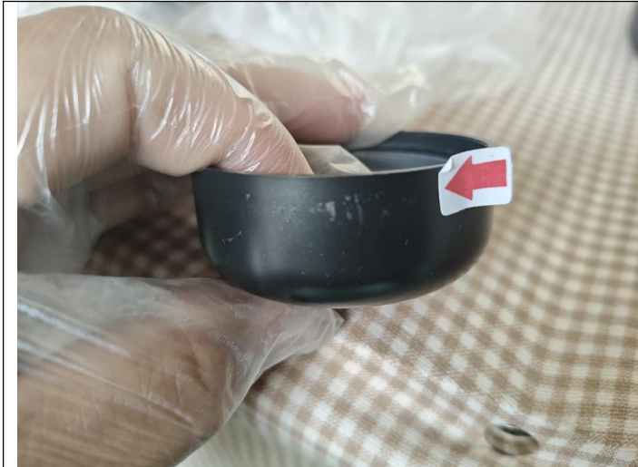
Scratch mark on out side -Min