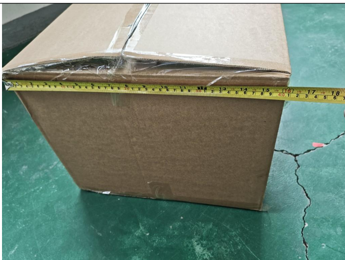
Carton size check:458x41x33 cm