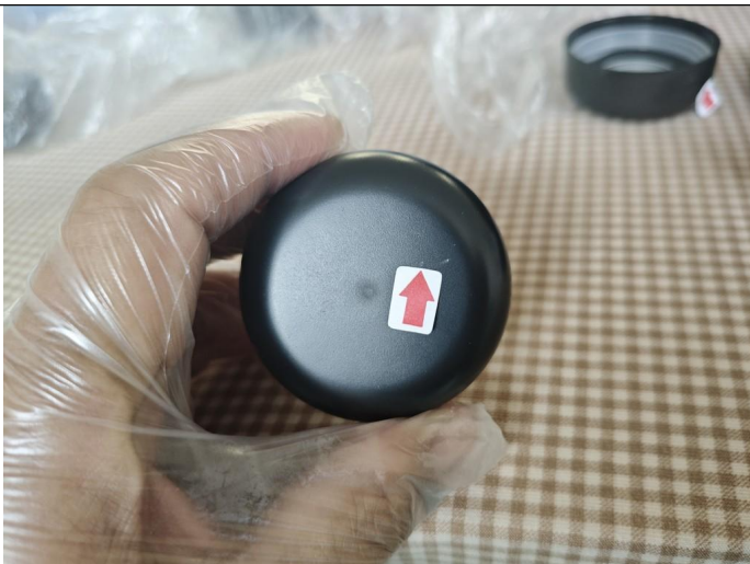
Scratch mark on out side -MIn