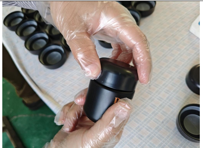
CR function test