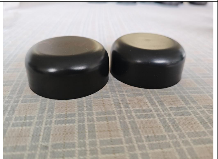
Reference sample on the left side