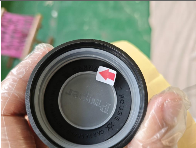
Deformed inside -MAJ