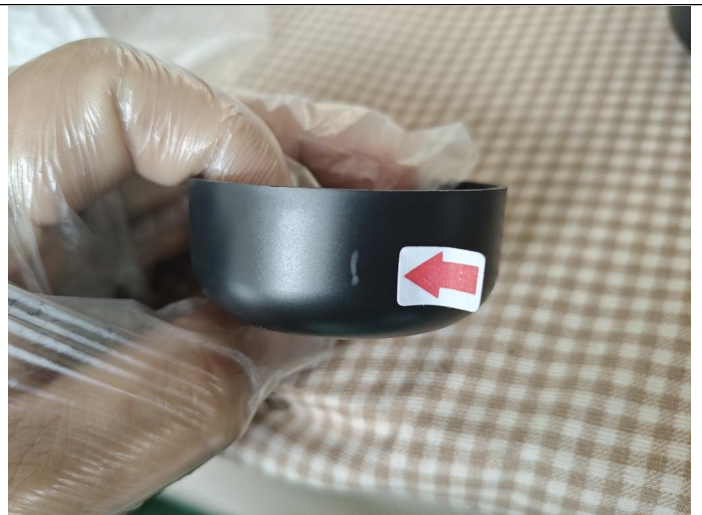
Scratch mark on out side -MIn