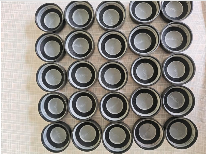
CR function test