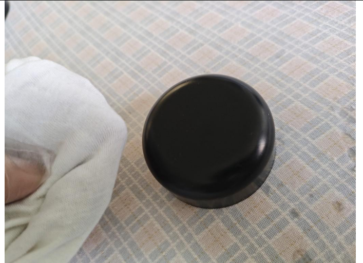
Color Fastness Test