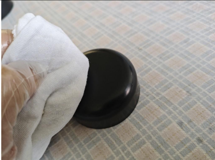
Color Fastness Test