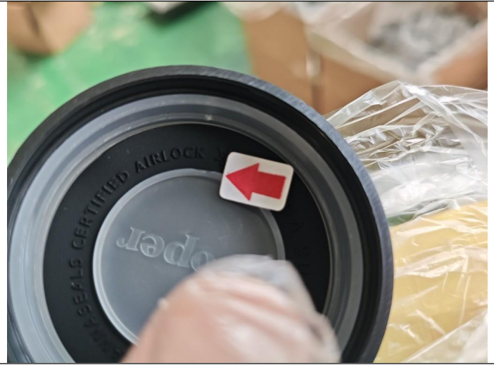
Deformed inside -MAJ