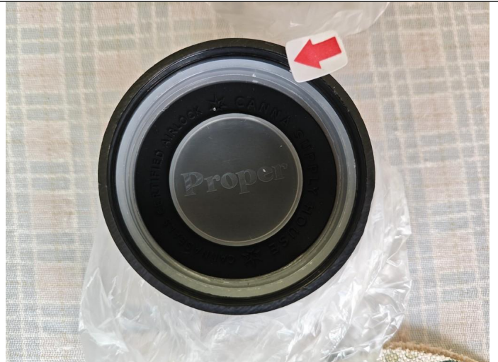
Dust mark inside -Min