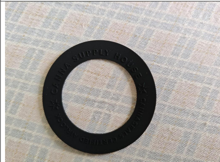
Product view / detail