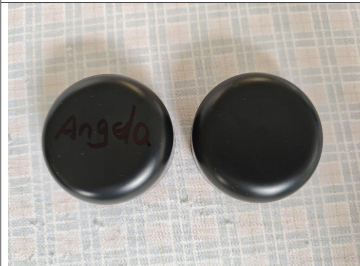
Reference sample on the left side