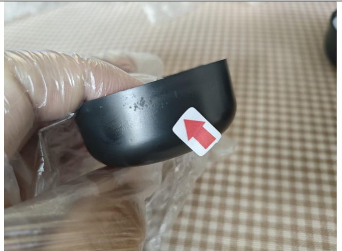
Scratch mark on out side -MIn