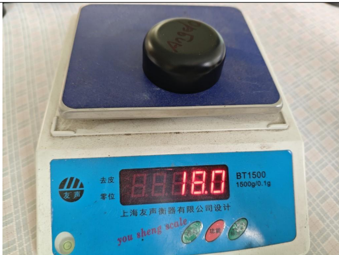
Reference sample weight check