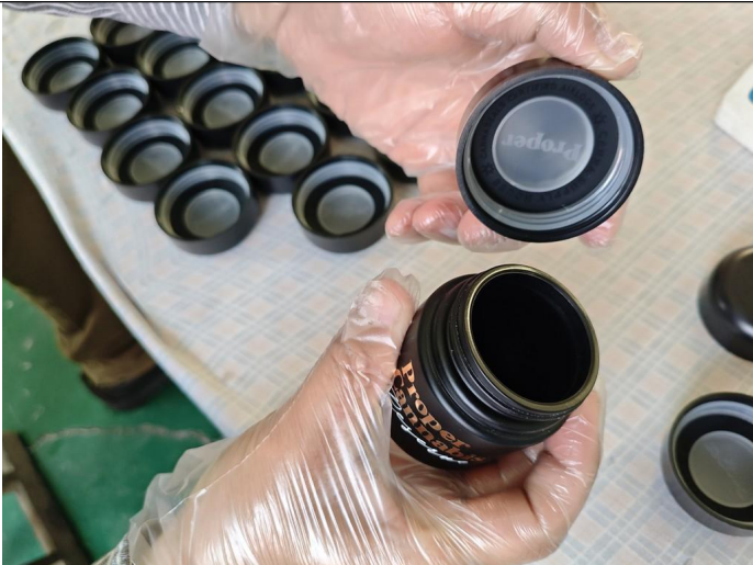
CR function test