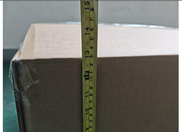
Carton size check:458x41x33 cm