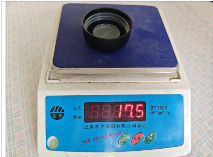
Product weight check