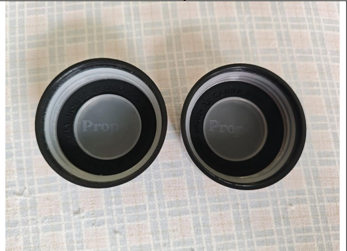
Reference sample on the left side