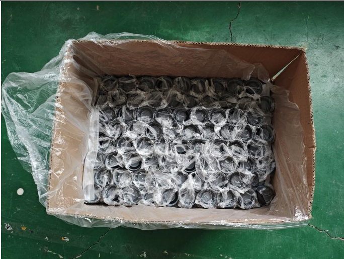
Open carton view