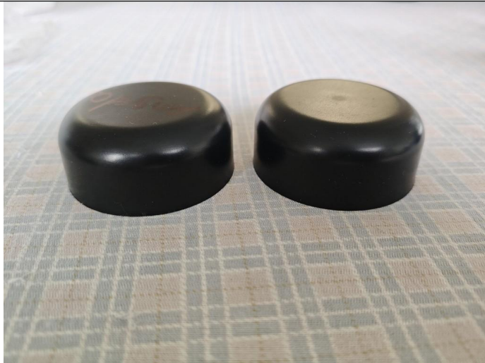
Reference sample on the left side