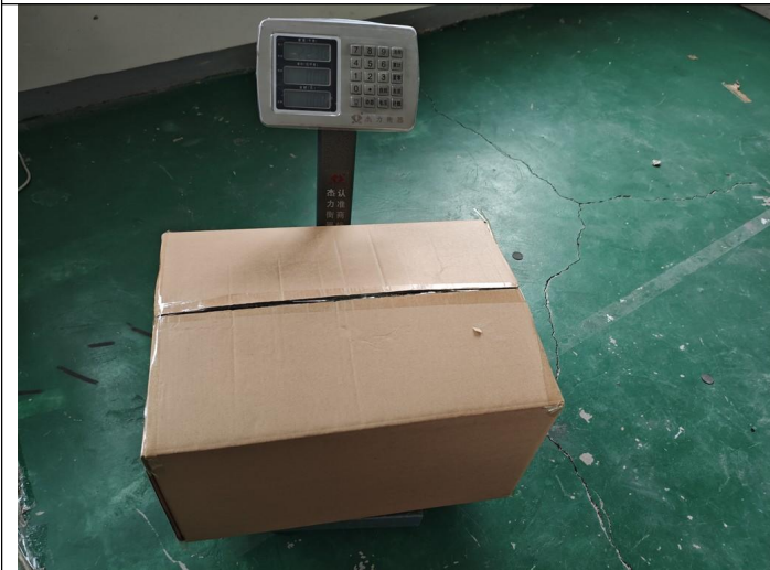
Carton weight check: 22.30 kg