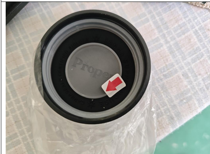
Dust mark inside -Min