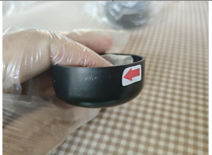
Scratch mark on out side -MIn