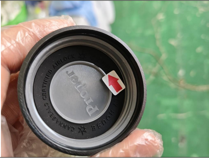
Deformed inside -MAJ