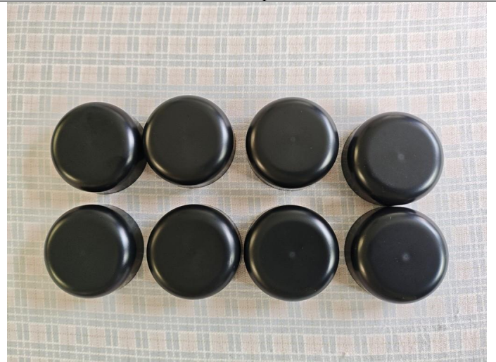
Color shade check