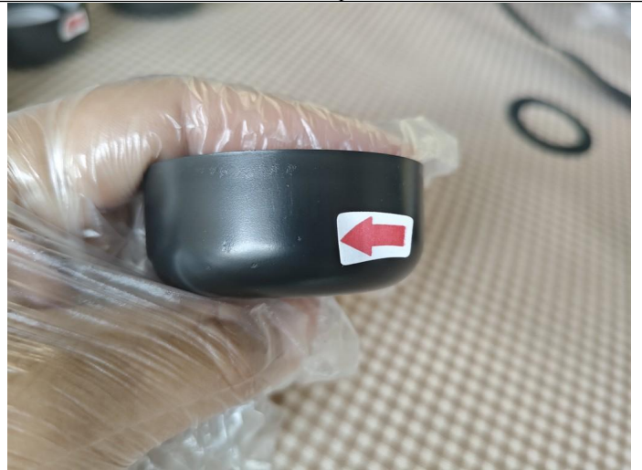
Scratch mark on inside -Min